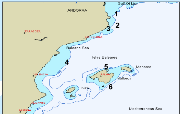
Fig 1. Sampling sites along the Spanish Mediterranean coast. 1. Cap de Creus 2. Medes Islands 3. Montgrí 4. Columbretes 5. Mallorca Coast 6. Cabrera National Park