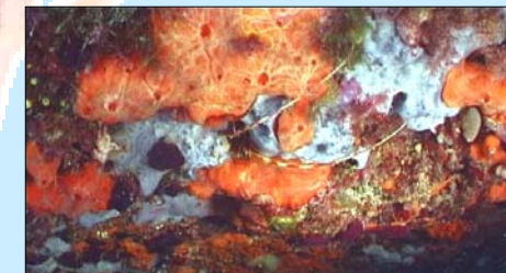
Fig 6. EBJ sheltered in a date mussel hole with a mosaic sponge microhabitat