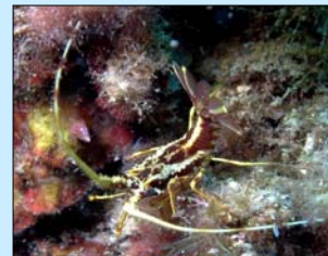
Fig 2. Early Benthic Juvenile of Palinurus elephas foraging outside the shelter at 10 mm Carapace length.